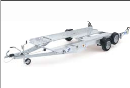
CT136 13'1" x 6'1" Single Axle Car Transporter Shown with wheel chocks & spare wheel as standard