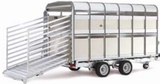
DP120G 12'x6'6" Dual Purpose Livestock Trailer (Wheel underneath/removable container. Available with removable Low Loading Drop Sides as an optional extra). With or without Fold-up Sheep Deck.