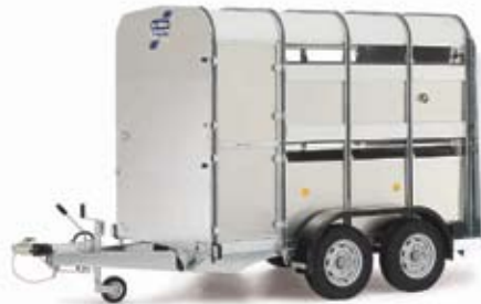
TA5G 8'x5'x6' H Livestock Trailer (Available with or without Fold-up Sheep Deck) Twin Axle. Fitted standard with rear ramp, aluminum loading gates and spare wheel.