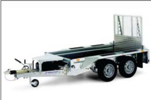
GX84 8' x 4' Plant Trailer 2700kg Gross Shown with 4' high ramp as standard