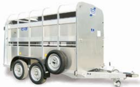
TA5G 10'x5'x6' H Livestock Trailer (Available with or without Fold-up Sheep Deck). Twin Axle. 175x16 Landrover wheel equipment. Model available with 7' headroom for horses (see opposite).