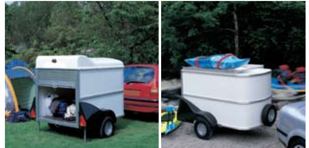
BV64e 6' x 4' x 4' Unbraked Box Van 500kg Gross Choice of roller shutter or van doors