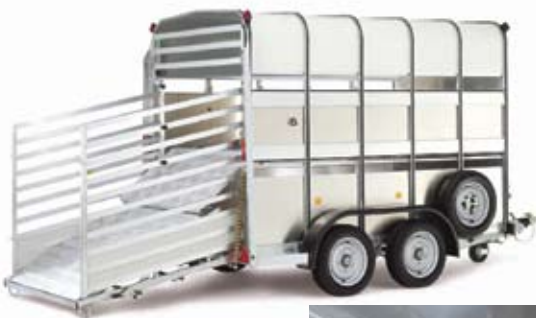
TA510G 12'x5'10"x7' High Headroom Horse & Livestock Trailer Available with or without Fold-up Sheep Deck. (Centre horse partition optional extra).