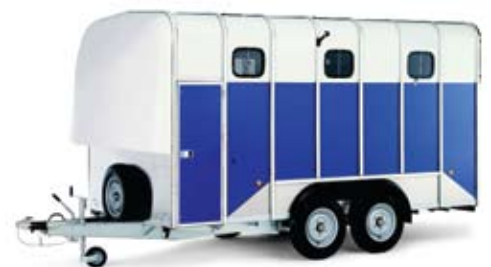
HB610 Extra Large Jumbo Deluxe Shown in blue with sliding windows