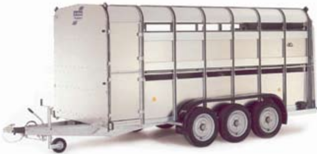
TA510G 14'x5'10"x6' H Livestock trailer (Available with or without Fold-up Sheep Deck. Twin and Tri-axle models available). 12' model 175x16 or 650x16 10ply Michelin. 14' model 175x16 or 650x16 10ply Michelin. 14' model Tri-axle only 175x16 wheel equipment.