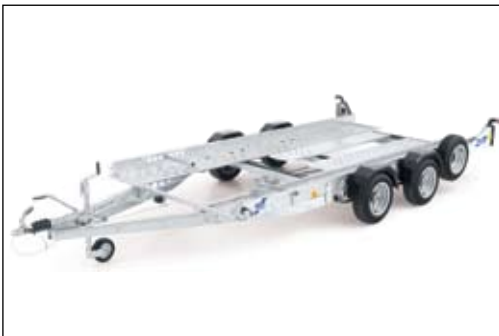
CT136 13'1" x 6'1" Twin Axle Car Transporter Shown with wheel chocks & spare wheel as standard