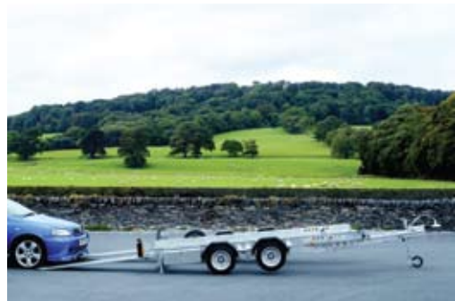
CT136 13'1" x 6'1" Twin Axle Car Transporter Shown with toolbox in loading position