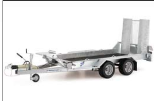
GH94 9' x 4' Plant Trailer 2700kg Gross Shown with ramp, bucket rest and heavy duty resin floor