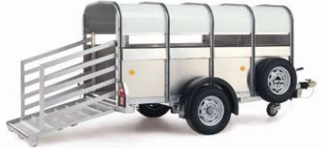
P8G 8'x4' Pig and Sheep Trailer Single Axle (Braked). Pig and Sheep Trailer is fitted standard with rear ramp, aluminum loading gates and spare wheel.