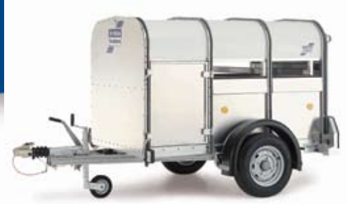
P6G 6'x4' Pig and Sheep Trailer Single Axle (Braked). Pig and Sheep Trailer is fitted standard with rear ramp, aluminum loading gates and spare wheel.

Our unique understanding of the agricultural community allow us to deliver the highest quality products and contribute to the protection of this precious way of life. Take a look at any of the features of our livestock trailers. You'll find that practicality, safety and reliability are paramount to us.