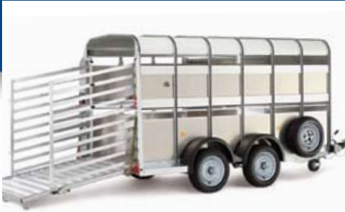
TA5G 12'x5'x6' H Livestock Trailer. (Available with or without Fold-up Sheep Deck). 175x16 or 650x16 10ply Michelin wheel equipment. Available in 10' and 12' models.