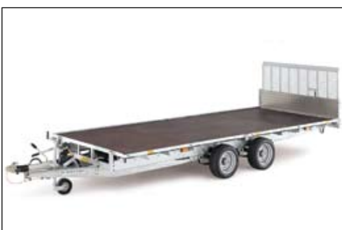
CT166G 16' x 6'6" Twin Axle Tilt Bed Shown without optional dropsides