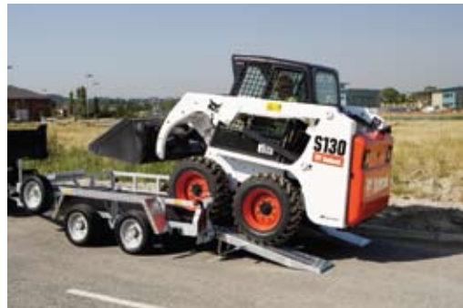
GP106 10' x 5'10" Plant Trailer 3500kg Gross Shown with open low sides and skids