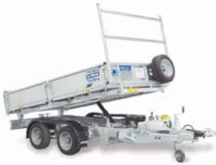
TT105G 10'x5'6" Tipping Trailer. 3500kg gross capacity. Electric model. Fitted with alloy floor and ladder rack as standard on this model.