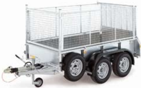
GD84G Twin Axle 8'x4' General Duty Trailer. 2700kg gross capacity. (Optional High Mesh Sides and Rear Ramp as shown).

The GD 4-series, 5-series and 6-series general purpose trailers have been designed from the ground up to withstand the rigours of the construction industry. All models have fixed headboard and sides, with the choice of a drop tailboard or a loading ramp. Chassis, framework and panels are galvanized for maximum durability. The platform is hard wearing resin-coated high density plywood. All models have a range of accessories which can be added, to enhance the use of the trailer.