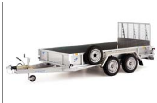
GP126H 12' x 5'10" Plant Trailer 3500kg Gross Shown with filled in high sides and 4' high ramp