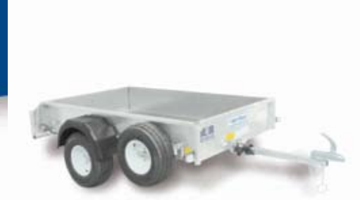
P6e 6'6" x 4' Galvanised Car Trailer Open, low tail board. 500kg gross capacity (On balloon flotation wheels). For on or off road use.

The canopy can be closed in with a rear lockable solid panel or ramp can be fitted suitable for small livestock. The body panels of the P6e are formed from the same thickness galvanised steel used on all plant and commercial ranges. This is also true of the 18mm thick high density plywood platform with a tough, waterproof resin coating on both sides. The drawbar and axle beam are hot-dipped galvanised steel.