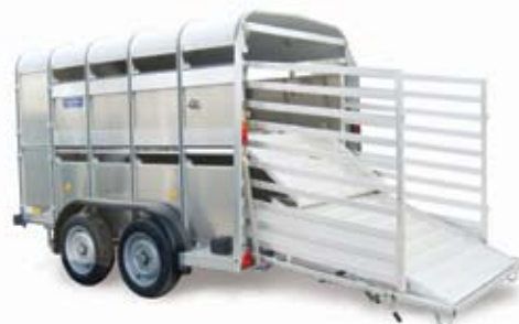
TA510G 10'x5'10'x6' H Livestock Trailer (Available with or without Fold-up Sheep Deck). Twin axle. 175 x 16 Landrover wheel equipment. Model available with 7' headroom for horses (see opposite).