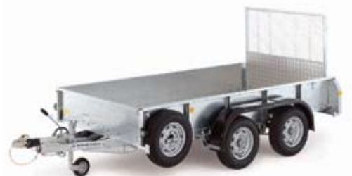
GD105G 10'x5' General Duty Trailer. 2700kg gross capacity. Shown (with optional High Loading Ramp). Full range of accessories can be added to this trailer.

All our trailers are fitted as standard with a heavy-duty Beam Axle and leaf springs. All bearings used are maintenance free and sealed for life, unique to Ifor Williams Trailers. This gives extra strength for robust use and dealing with Irish road conditions.