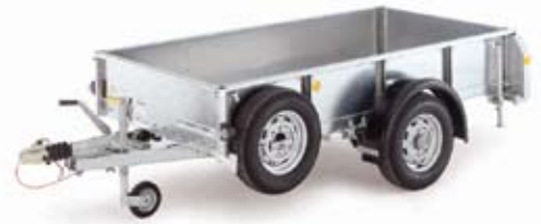
GD84G Single Axle General Duty Trailer. 1350kg gross capacity. (Available in GD64G 6'x4'). EU braked trailer.