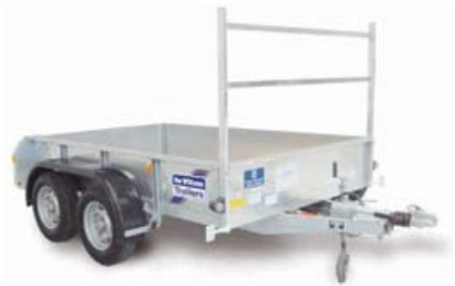
GD85G Twin Axle 8'x5' General Duty Trailer. 2700kg gross capacity. (Optional Ladder Rack as shown). Full range of accessories can be added to this trailer.