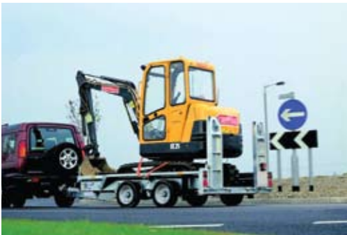
GX105 10' x 5' Plant Trailer 3500kg Gross Shown with skids. Also available with ramp