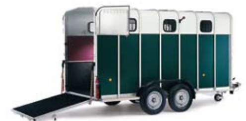
HB610 Extra Large Jumbo Deluxe Shown in green with sliding windows