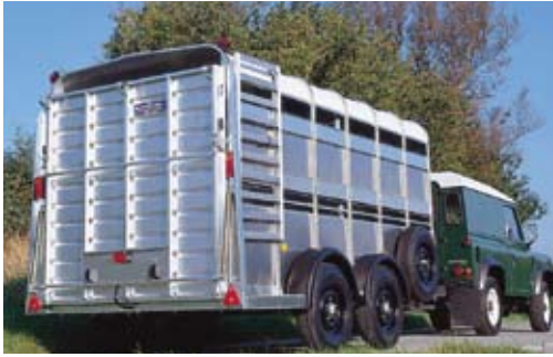
TA510G 12'x5'10"x6' H Livestock Trailer (Available with or without Fold-up Sheep Deck). 175x16 or 650x16 10ply Michelin wheel equipment. Available in 10', 12' and 14' models. (Extension gates optional extra).