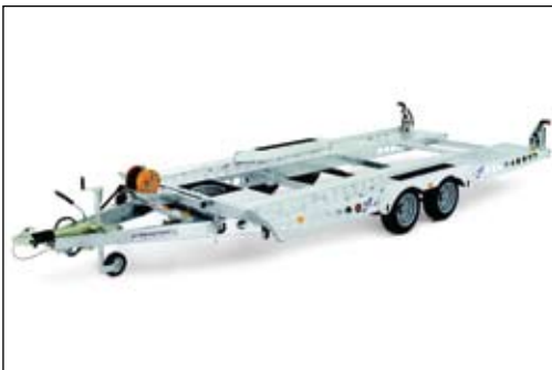
CT177 16'9" x 6'2" Twin Axle Car Transporter Shown with optional winch