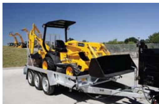
GP146 14' x 5'10" Plant Trailer 3500kg Gross Tri Axle shown with filled in low sides and 6' high ramp