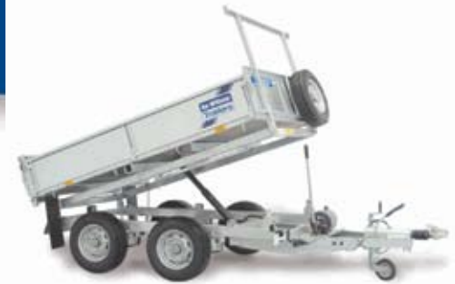
TT85G 8'x4'9" Tipping Trailer. 2600kg gross capacity. Available in Hand and Electric models.