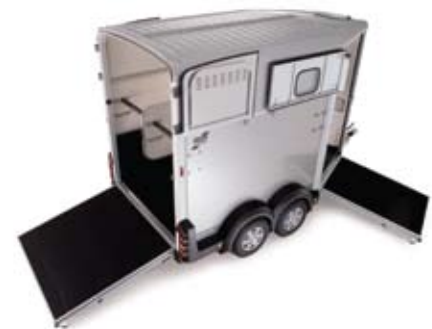
HB511 Large Deluxe Double Shown in silver with alloy wheels