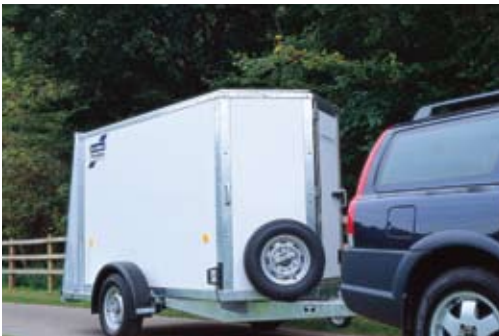
BV84G 8' x 4' x 5' Box Van 2700kg Gross Choice of roller shutter or ramp/door combination