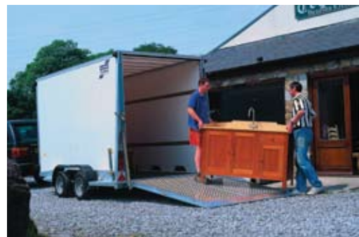
BV126G 12' x 5'10'' x 7' Box Van 3500kg Gross Choice of roller shutter or ramp/door combination