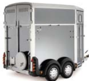
HB506 Deluxe Double Shown in silver with wheel trims