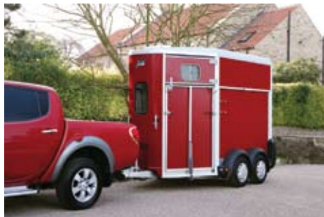
HB506 Deluxe Double Shown in red with sliding windows & wheel trims