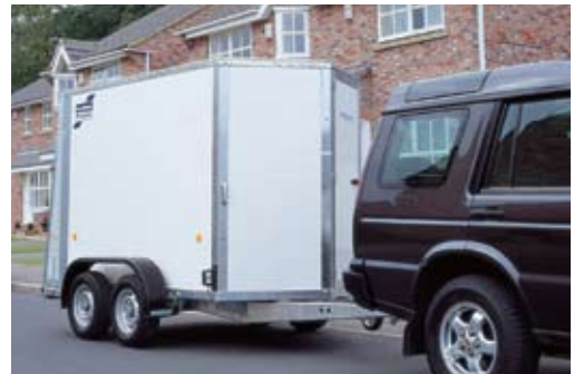
BV85G 8' x 5' x 6' Box Van 2700kg Gross Choice of roller shutter or ramp/door combination