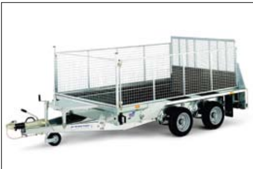
GX106 10' x 6' Plant Trailer 3500kg Gross Shown with 4' high ramp and mesh sides