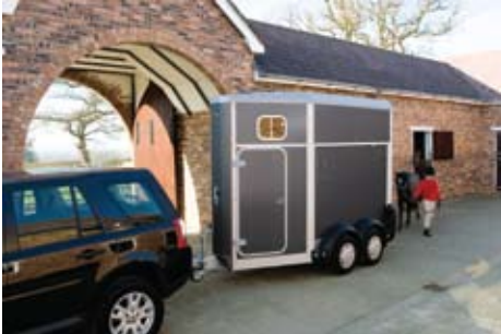
HB403 Deluxe Single / Mare & Foal Shown in graphite with sliding windows & wheel trims