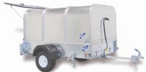
P6e 6'6" x 4' Galvanised Car Trailer with aluminum canopy. Fitted with lockable rear solid panel. 500kg gross capacity (On balloon flotation wheels).