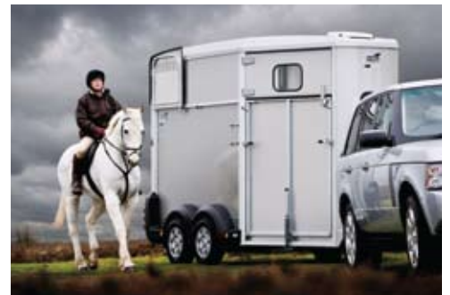
HB511 Large Deluxe Double Shown in silver with alloy wheels