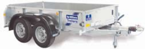
GD84G Twin Axle 8'x4' General Duty Trailer. 2700kg gross capacity. (Available in Single Axle as above). Full range of accessories can be added to this trailer.