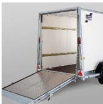
Ramp / Door Combination