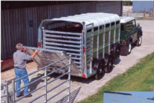
TA510G 12'x5'10'x6' H Livestock Trailer available with or without Fold-up Hydraulic Sheep Deck.