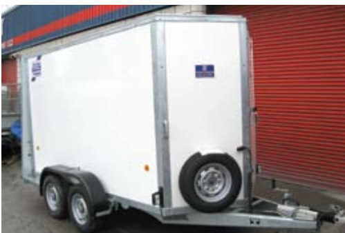
BV105G 10' x 5' x 6' Box Van 2700kg Gross Choice of roller shutter or ramp/door combination