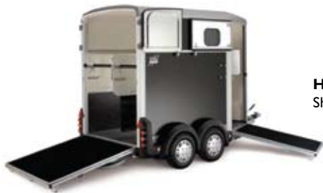
HB506 Deluxe Double Shown in black with wheel trims