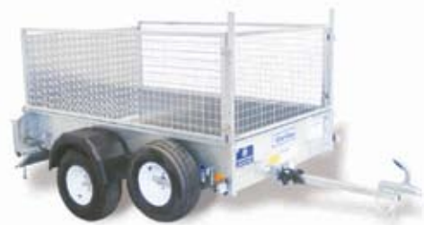
P6e 6'6" x 4' Galvanised Car Trailer with high loading ramp and mesh sides. 500kg gross capacity (On balloon flotation wheels). For on or off road use.