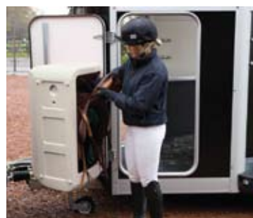
Tack Box door mounted