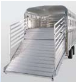
Easy Load Fold-up Hydraulic Sheep Deck System.