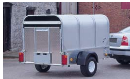
P6e 6'6" x 4' Galvanised Car Trailer with canopy. 500kg Gross Capacity (Available with ramp as shown or hinged closed panel back as above).