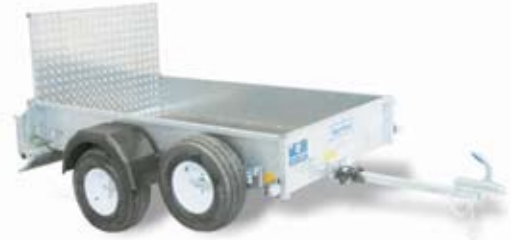
P6e 6'6" x 4' Galvanised Car Trailer with high loading ramp. 500kg gross capacity (On balloon flotation wheels). For on or off road use.