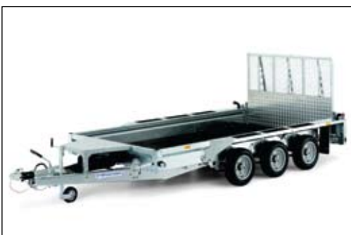
GX126 12' x 6' Plant Trailer 3500kg Gross Tri Axle shown with 4' high ramp