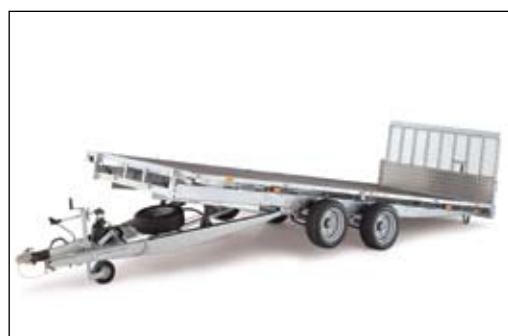
CT166G 16' x 6'6" Twin Axle Tilt Bed Shown without optional dropsides in loading position