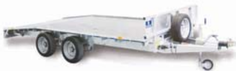
LMI46G/B 14'x6'6" Beaver Tail Trailer. 3500kg gross capacity. Fitted standard with front head board, 6' galvanized loading ramps and rear prop stands as standard. (Available in 16' model).