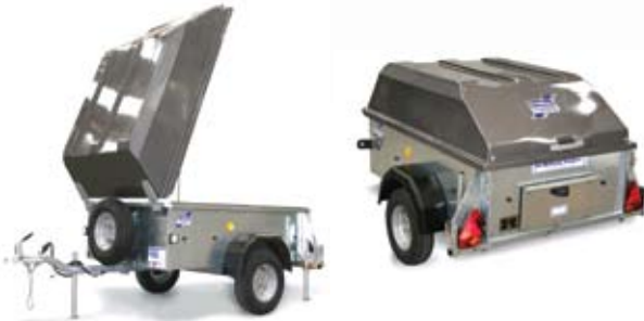
P5e 5' x 3' Unbraked Single Axle 500 kg Gross Shown with hinged fibreglass lid