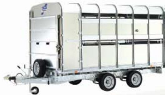
DP120G 12'x6'6" Dual Purpose Livestock Trailer. (Wheel underneath/removable container. Available with no Deck or Fold-up Sheep Decks. Cattle dividing gate optional extra.)