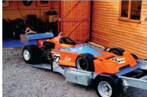
CT136 13'1" x 6'1" Single Axle Car Transporter Shown with toolbox in loading position