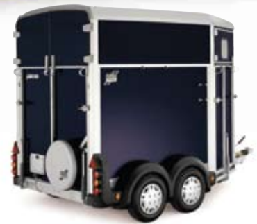
HB506 Deluxe Double Shown in blue with wheel trims