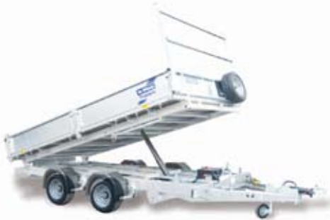
TT126G 12'x6'6" Tipping Trailer. 3500kg gross capacity. Electric model. Fitted with alloy floor and ladder rack as standard on this model.